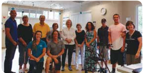
Treasure Coast Support Group

The Treasure Coast Ataxia Support Group held a meeting on Saturday, April 21, at the Florida Movement Therapy Center in Palm Beach Gardens. The meeting was very energetic and informative, everyone had a great time. This meeting is in North Palm Beach, FL; however, we may have another meeting here in November 2018. The Treasure Coast Ataxia Support Group will meet in West Palm Beach, Fl at least once a year.