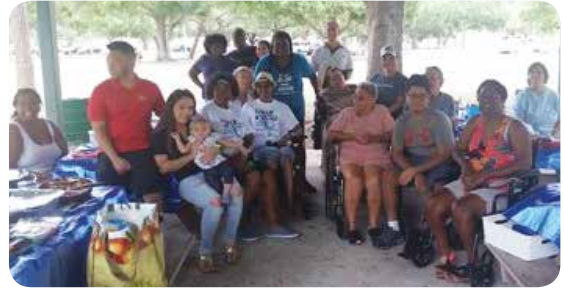
Tampa Bay Support Group

The Tampa Bay Ataxia Support Group held their annual picnic on May 12, at the Al Lopez Park in Tampa, Fl. We decorated Ataxia Rocks, played board games and fellowshiped with each other. We had grilled hamburgers, hot dogs, baked beans, yellow rice, potato salad and a host of desserts. Thank you to everybody that participated at the Al Lopez Park picnic, we had a great time!